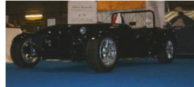
GTS Locost 7 at the Exeter Kit Car show

The 10 piece high quality body is made of GRP and comes in a choice of 70 different colours.